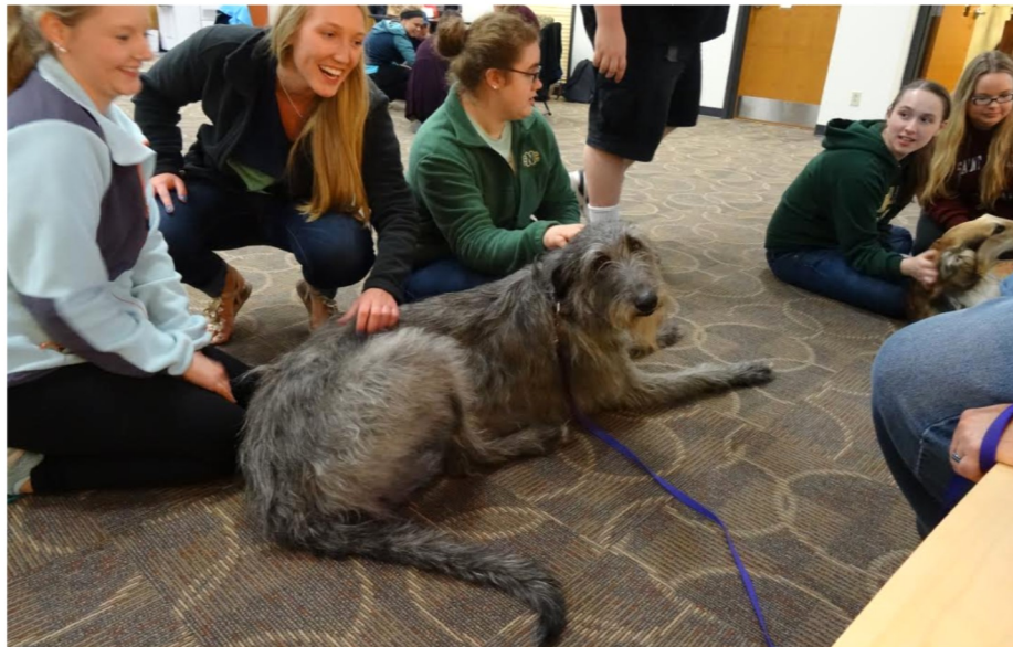
St. Norbert College, May 12, 2015